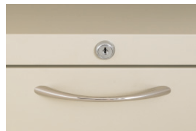
Removable Core Lock With Aluminum Drawer Pull