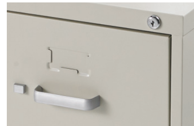
Removable Core Lock With Aluminum Drawer Pull, Label Holder and Thumb Latch