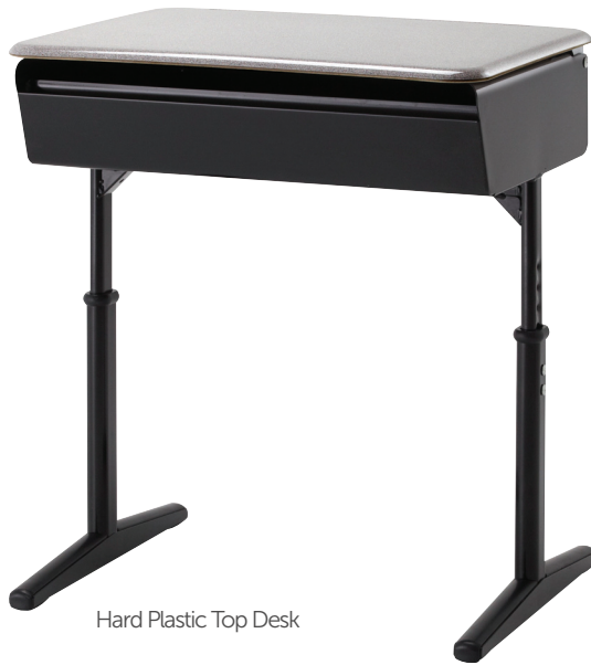
Hard Plastic Top Desk