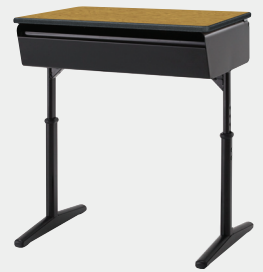
Laminate Top Desk with LockEdge