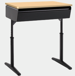
Laminate Top Desk