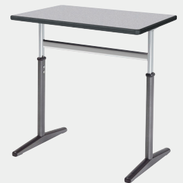
Laminate Top Desk with LockEdge