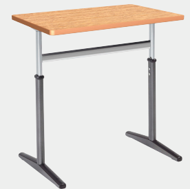
Laminate Top Desk