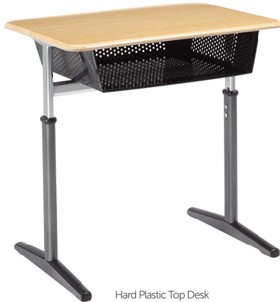
Hard Plastic Top Desk with Optional Metal Book Box